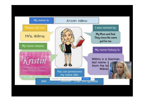
Click here for a French option!

Getting to know each other virtually is a little different than in class. Here is an activity for you to do today so that you are prepared to introduce yourself to your teacher and classmates tomorrow! Check out this video entitled, "Your Name is a Song".